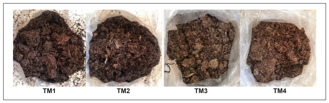
Figure 1. Characteristics of bio-compost

The bio- compost's N, P, and K contents varied from 311–350, 154–197, and 23–25 mg/100 g, respectively. Furthermore, the pH value of the bio-compost ranged from 8.1–8.4,